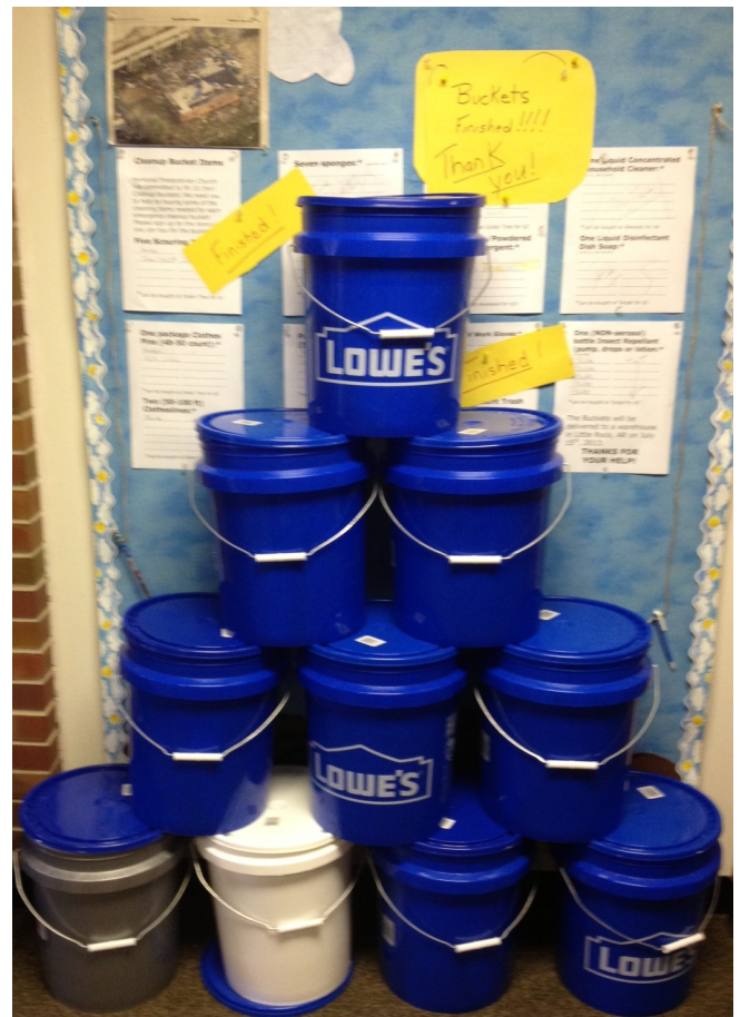
Clean-up buckets ready for delivery

Sunday School Kick-Off: There will be no Sunday School for children and youth on Labor Day Sunday, September 1. The kick-off for the new church school year will be Sunday, September 8 in the Fellowship Hall beginning at 9:30 A.M. There will be an intergenerational program to help children, youth, young adults, and older adults become better connected.