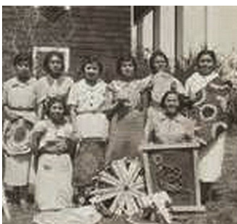
The crafty ladies of the Female Benevolence Society

Primary Resource: Mission to the Cherokees by O.B. Campbell, 1969