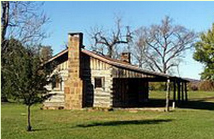
Photo is of Dwight's small museum which is on the National Registry of Historic Places. Some of the logs are from a cabin which survived the Civil War.

Primary Resource: Mission to the Cherokees by O. B. Campbell, 1969