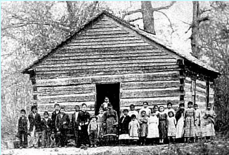
Photo: The only school house until 5th Avenue Presbyterian Women of New York City provided funds.

Primary Resource: Mission to the Cherokees by O. B. Campbell, 1969