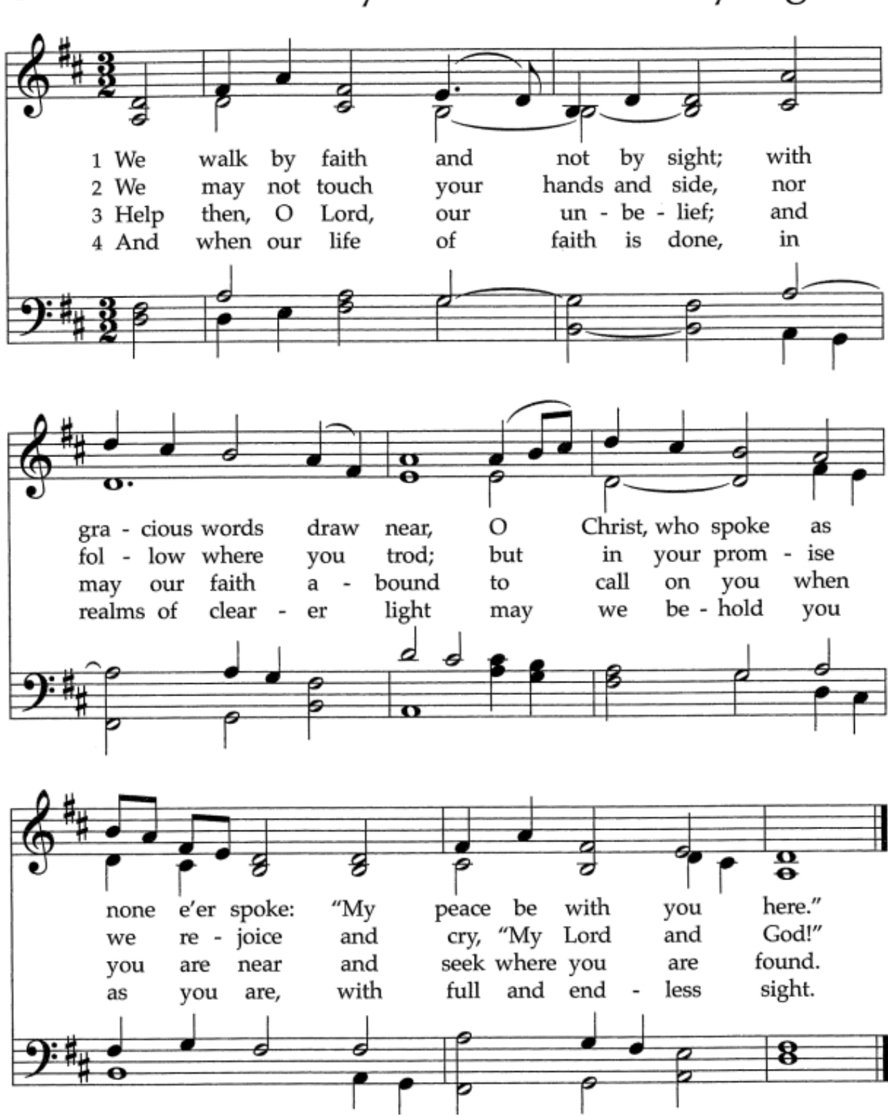
817 We Walk by Faith and Not by Sight