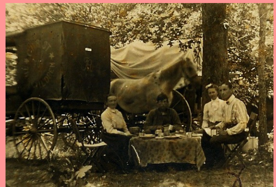
Photographs: Presbyterian Gospel Wagon caravan (1902) and missionaries at their campsite (1903)