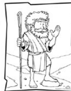
JOHN THE BAPTIST Matthew 3

W L U Z M H V J O J Q V Q S U I Y V S L O G N K M D B H A K K C T X T N M R H K Y T E X X C I X J T E Z Y J T A E S L E P N N Y Y Y A S L P P T R Z T R B M G J W I L D G S U E S Q E D A H D H A I R U X G P T C P Z O P Y O U S C E N U E R F A T O Q T W M O H I N J N A F R Z S G N I L O H L R L T I M E Z J N P O Z C P N E P Y G P E S P O A E A E H M N N Z H C L O R D H E M T A F T Q X T Y J W K K R N J C U Y C T Q T U I X E P F N M H L D Z D E N I