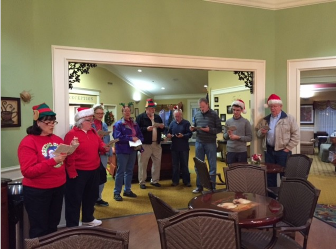
The choir caroling at Rivermont