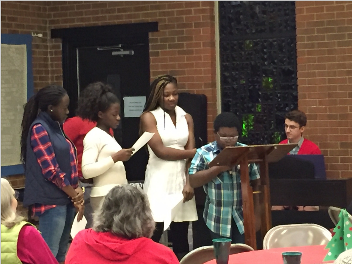
Narrators for the Christmas Story