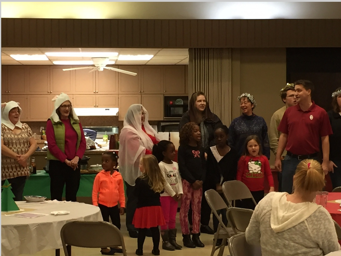
An unconventional Christmas Pageant