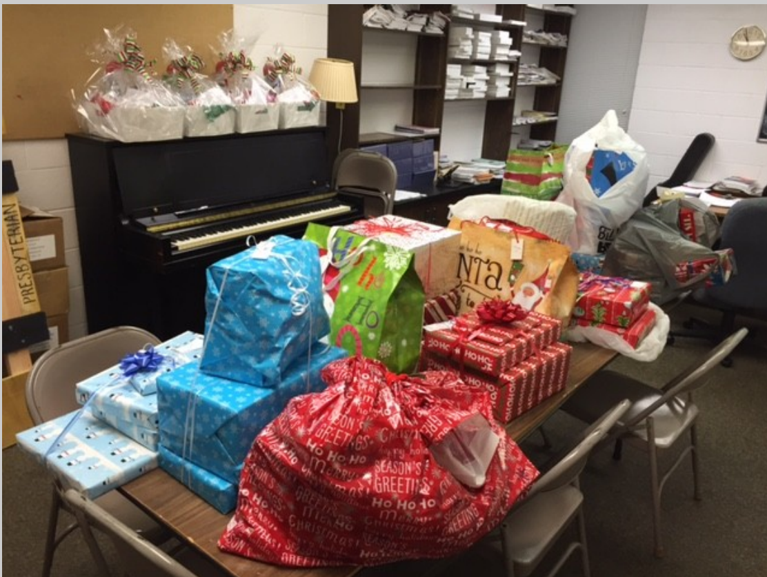
Gifts for kids and moms at the Women's Resource Center, ready for delivery!