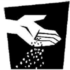
Mustard Seed Faith

The puzzle is based on Luke 17:5-10 (NIV).