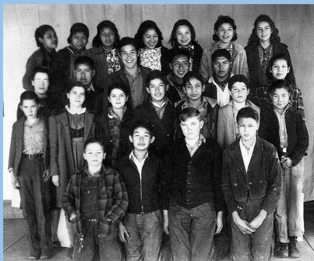
Photo: Dwight Mission classmates